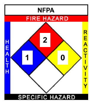
Health = 1, Fire = 2, Reactivity = 0 H1/F2/PH0