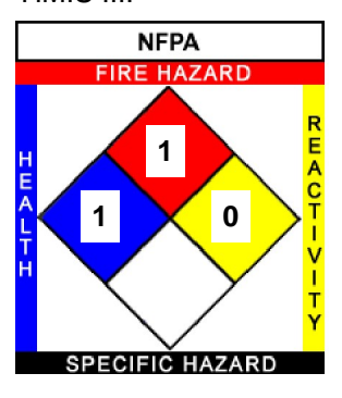
Health = 1, Fire = 1, Reactivity = 0 H1/F1/PH0