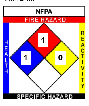
Health = 1, Fire = 1, Reactivity = 0 H1/F1/PH0