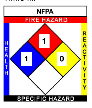
Health = 1, Fire = 1, Reactivity = 0 H*1/F1/PH0